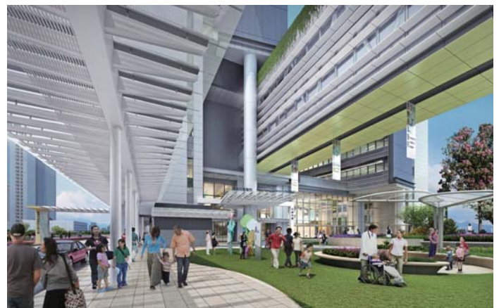
A welcoming atmosphere at the Hospital entrance.

Being the first purpose-built hospital for our children in Hong Kong, the overall design objective of the Hong Kong Children's Hospital (HKCH) is to create a home-like and child-friendly environment that provide an uplifting healing experience to our sick children. A pleasant and soothing atmosphere is aimed to relieve the tension and stress from the sick children and their carers.