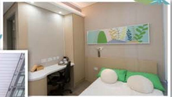
Parent Overnight Room