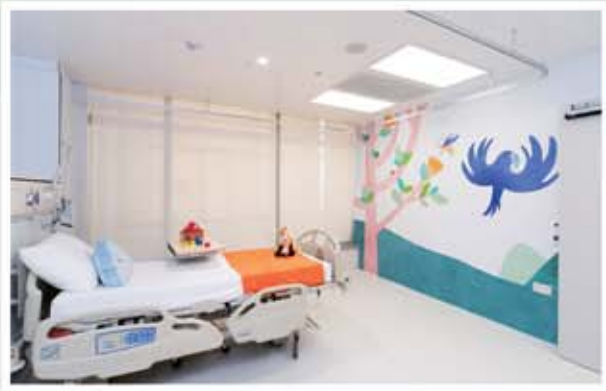
Animal friends accompanying our sick children day and night, in good times and bad times.