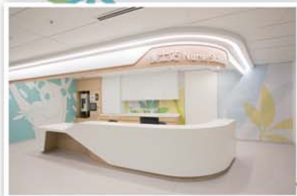
Nursing Station inside the Ward