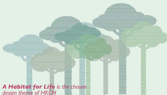
A Habitat for Life is the chosen design theme of HKCH

Much effort has been made to understand more about the needs of our patients and their carers through focus group interviews and telephone interviews. They were conducted in 2009 to collect the views of various stakeholders, including our patients and their parents, regarding the design of HKCH. Reference was taken from the overseas children's hospitals. There were also extensive and ongoing consultations with our clinicians and end users to tailor made the design in order to fit the hospital operations and to address our patients' needs.